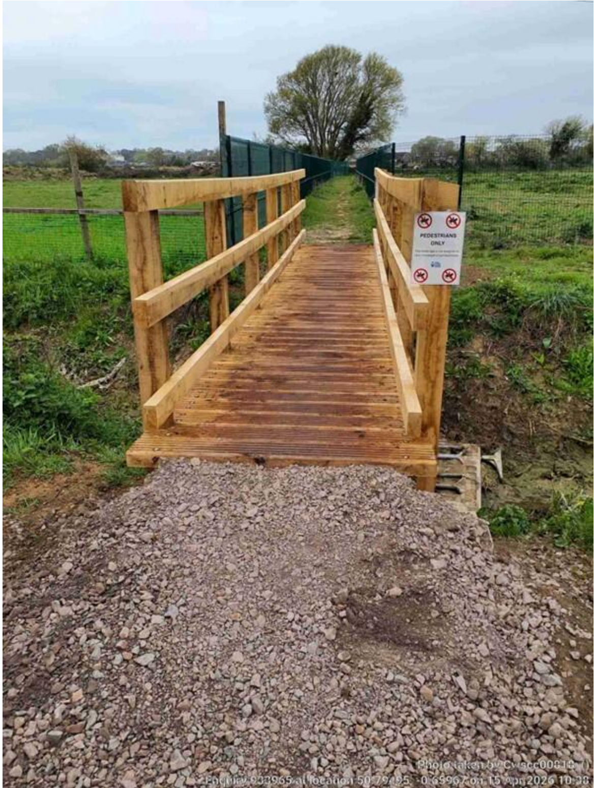
Photo taken by C:\acc00818 (1) Enquiry 933965 at location 50.79195, -0.69967 on 15 April 2026 10:38